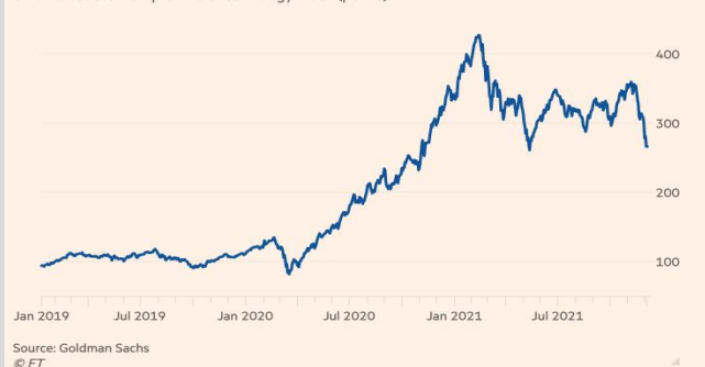
No profits; no problem - until now Goldman Sachs' non-profitable technology index (points)

Another section of the market caught up in the froth was the IPO/SPAC market. Most of us are familiar with IPOs, but SPACs are vehicles which don't exist in Australia; we looked at them in our February 2021 report.