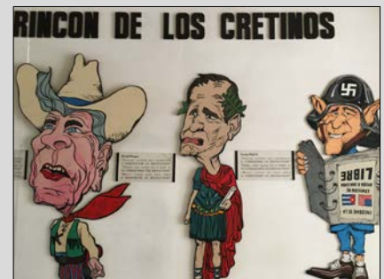
("Corner of the Cretins")